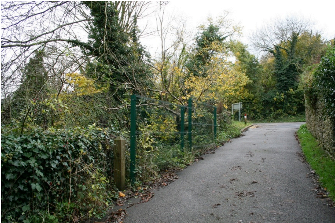
Figure 19: Modern steel fencing, The Quarries