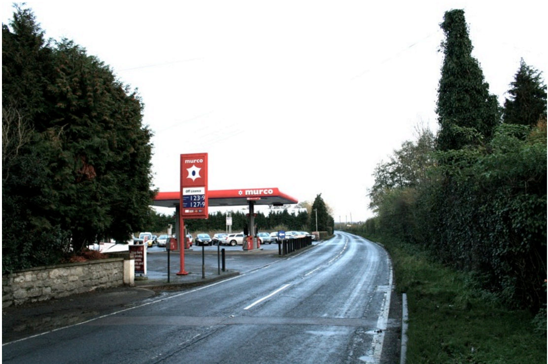
Figure 3: Petrol filling station, Heath Road