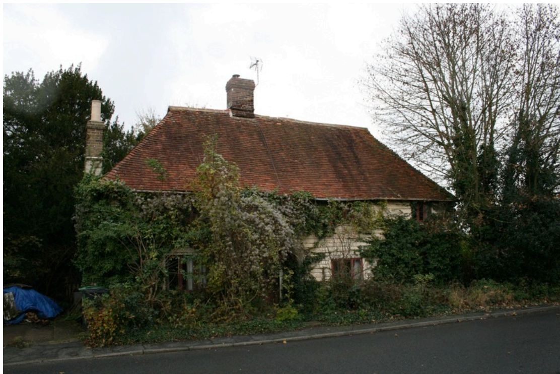
Figure 10: Laburnam Cottage