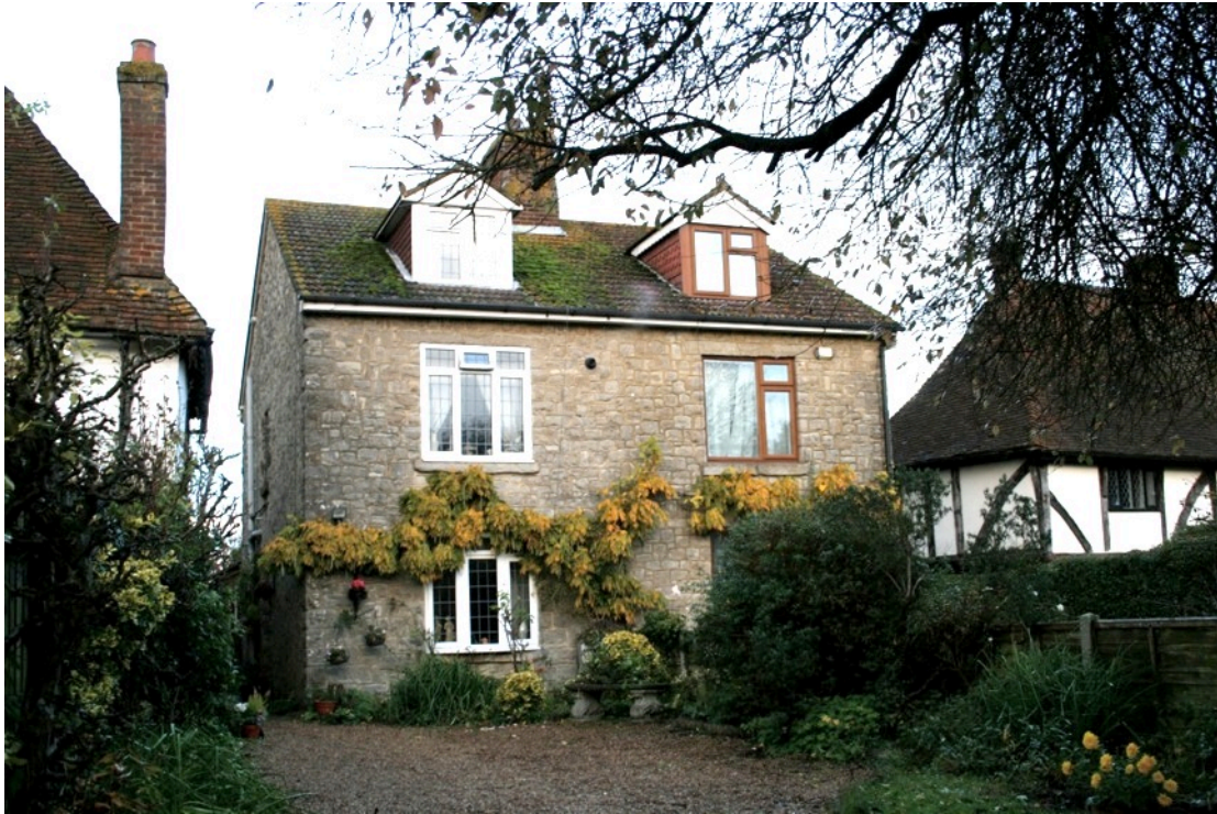
Figure 1: 1 and 2 Stone Cottages