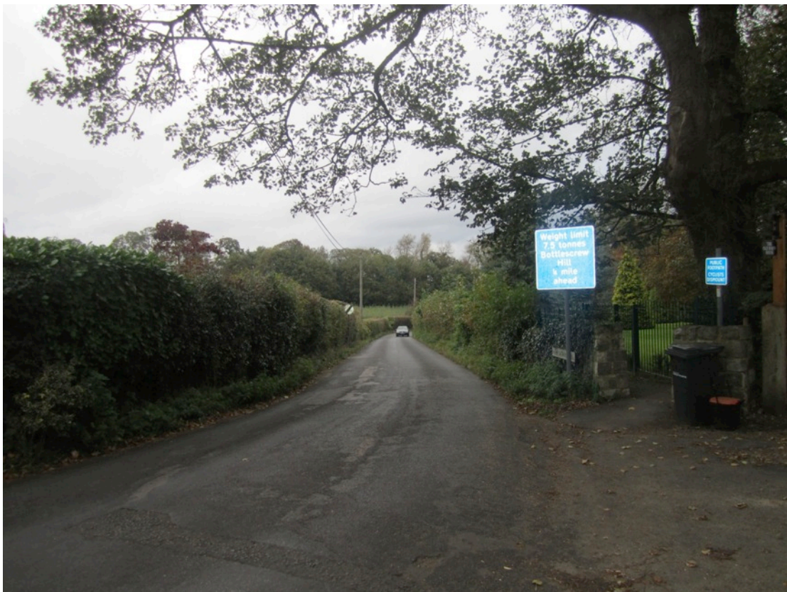
Figure 12: Reflective sign, Bottlescrew Hill