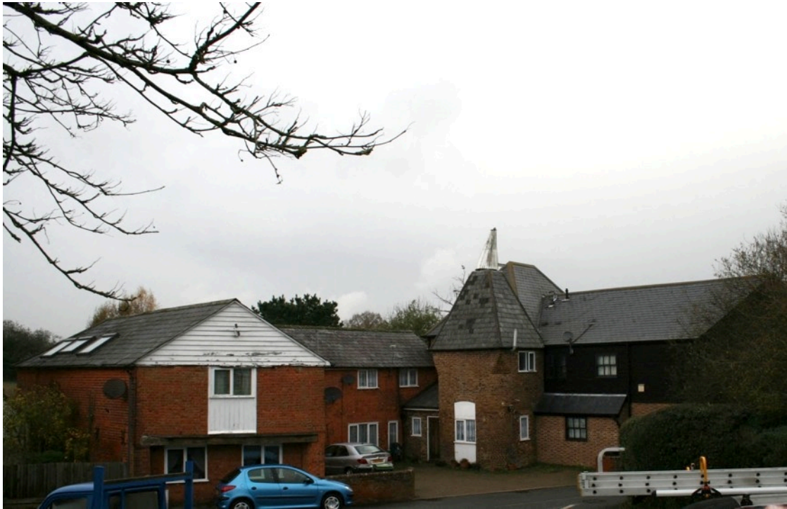
Figure 5: Cart Lodge Oast; (gabled brick range to left is currently outside the conservation area)