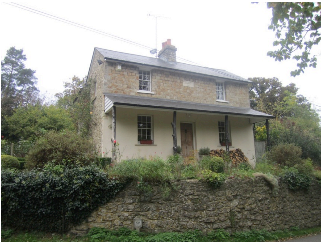
Figure 20: Boughton Mount Cottages