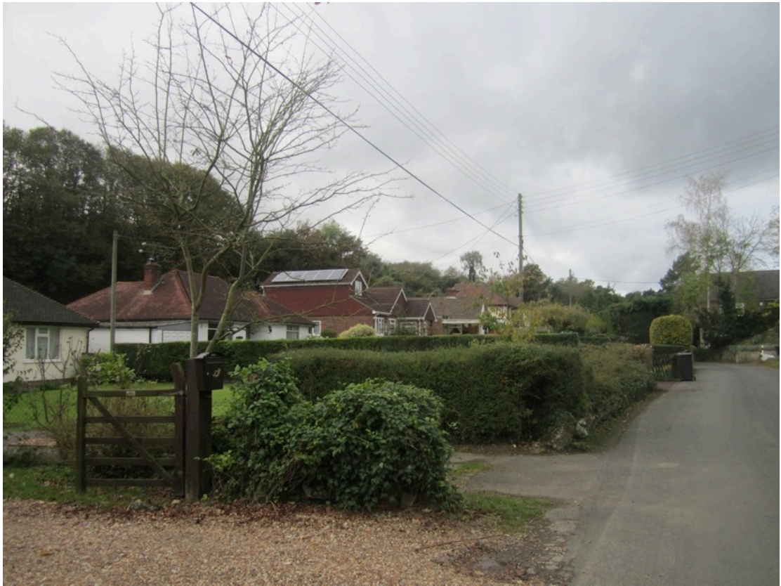
Figure 17: Quarry Road looking west towards conservation area