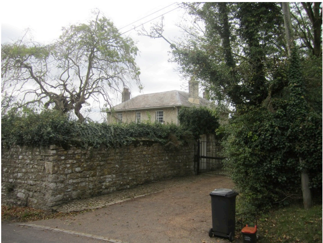
Figure 18: Rock House