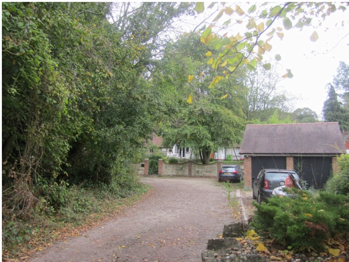
Figure 16: View towards Forge Cottages from the present CA boundary