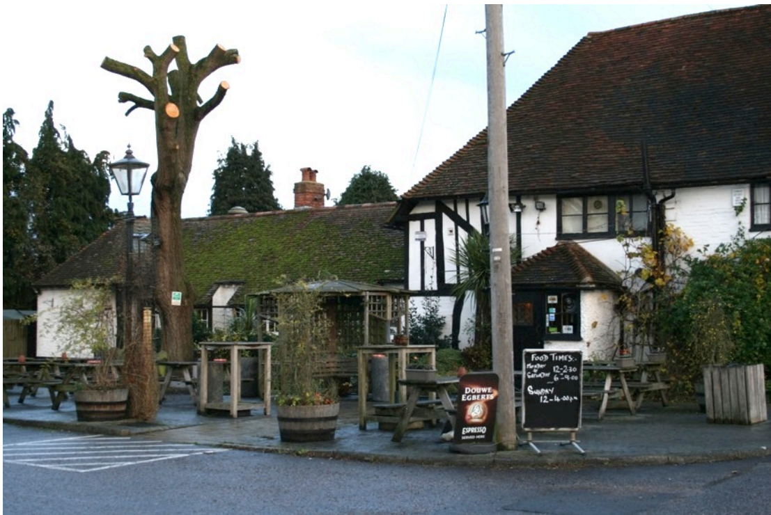
Figure 2: Setting of the Cock Inn