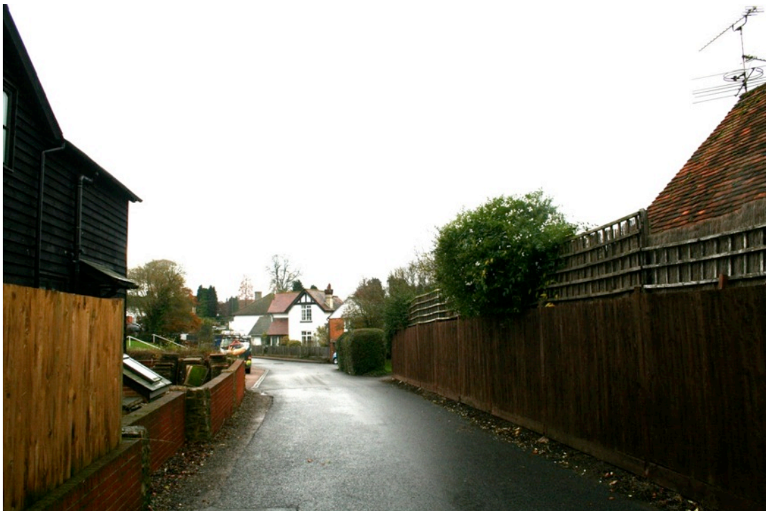
Figure 6: Green Lane, looking west