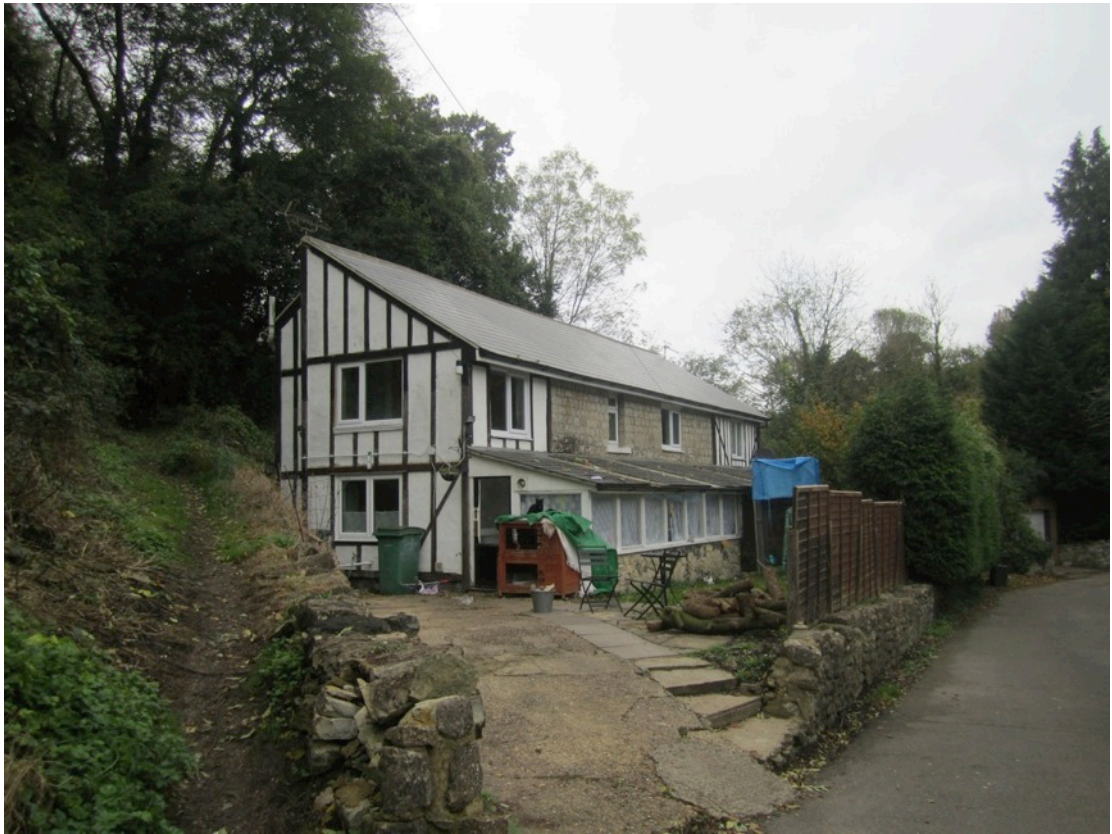
Figure 13: Quarry Cottages