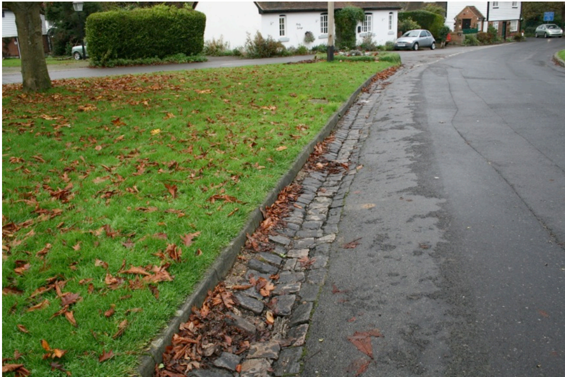
Figure 11: Ragstone gutter, Boughton Green