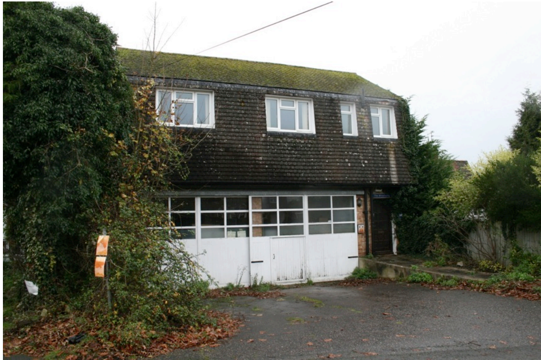
Figure 9: Wheelwrights, Boughton Green