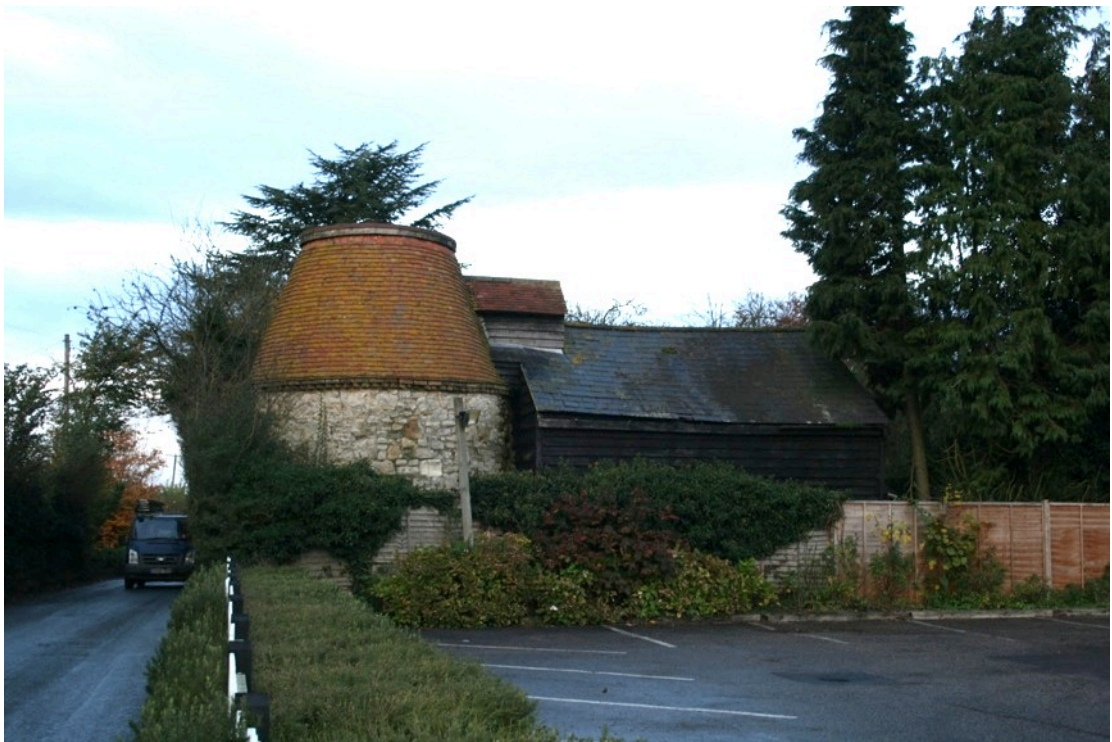
Figure 4: Rivendale Oast House