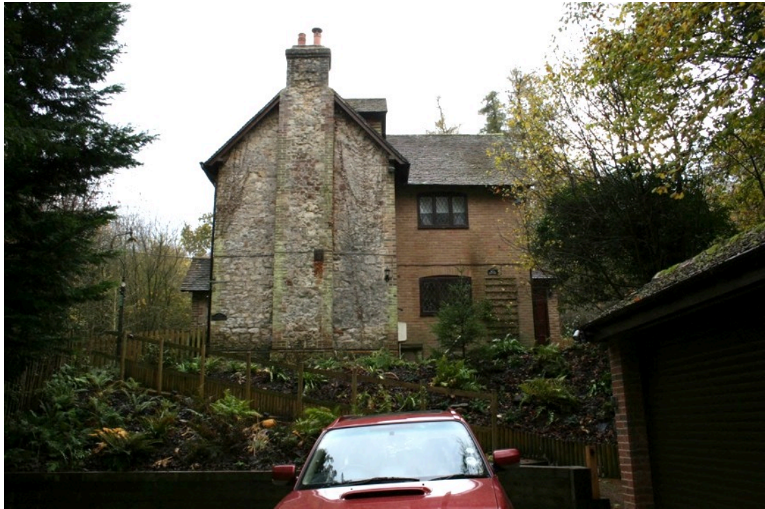
Figure 15: Wood Cottage