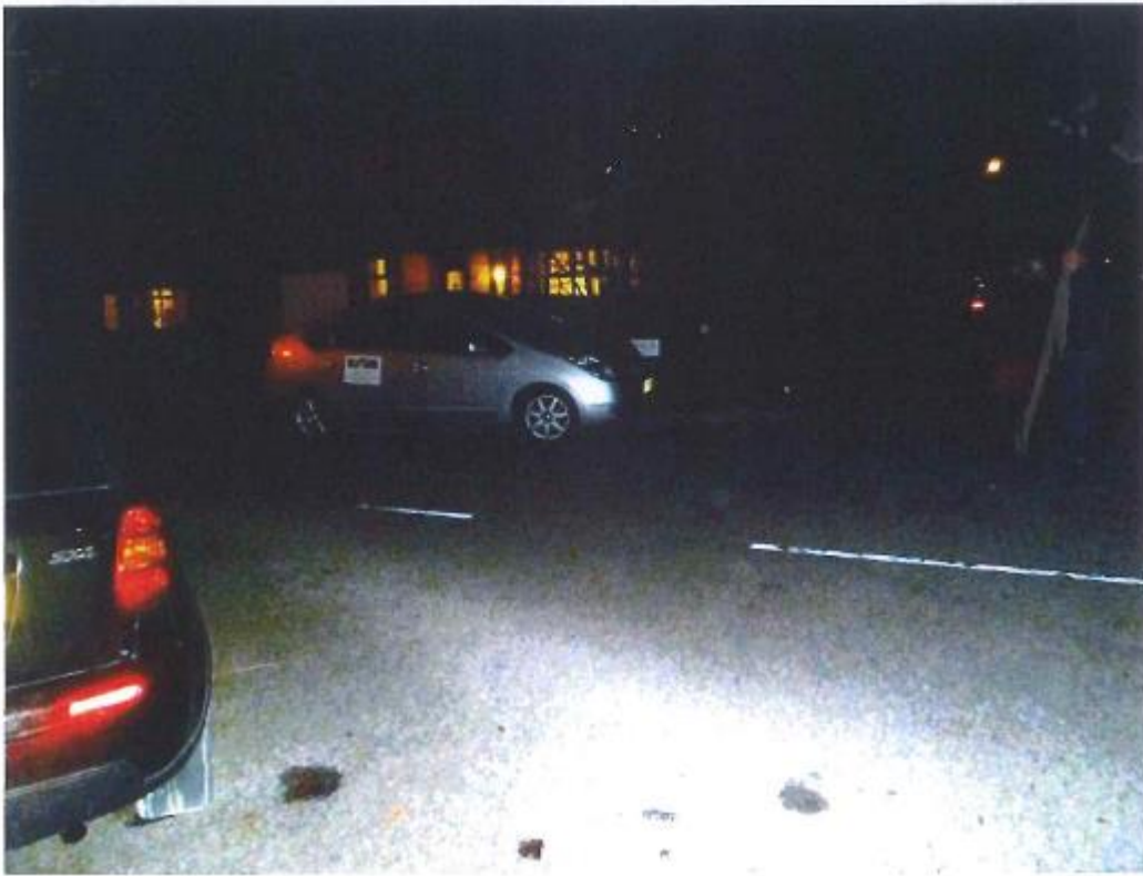
Boxley Parish Council, Beechen Hall, Wildfell Close, Walderslade, Chatham, Kent ME5 9RU