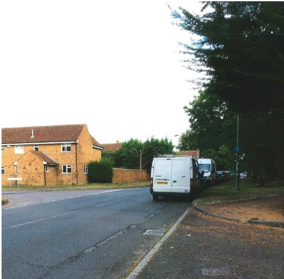
Boxley Parish Council, Beechen Hall, Wildfell Close, Walderslade, Chatham, Kent ME5 9RU