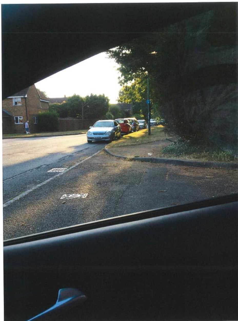
Boxley Parish Council, Beechen Hall, Wildfell Close, Walderslade, Chatham, Kent ME5 9RU