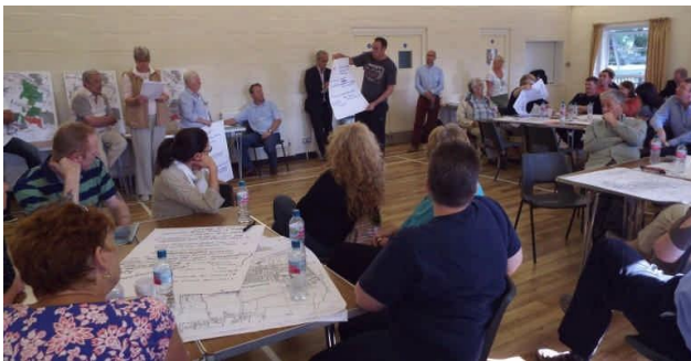
Neighbourhood Plan Community workshop