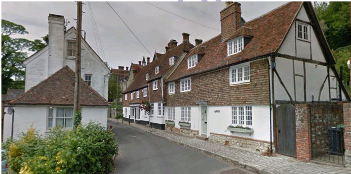
High Street – looking west