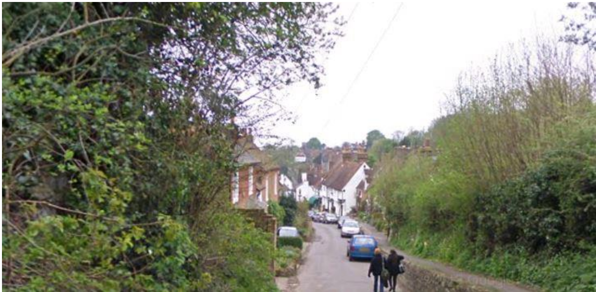
Tumblers Hill view looking west into the conservation area

developed part of Sutton Valence, with its modest and modern houses, on the lower slopes of the ridge. Although the lane ends at the Green with Holdgate House on the right there is little sense of arrival.