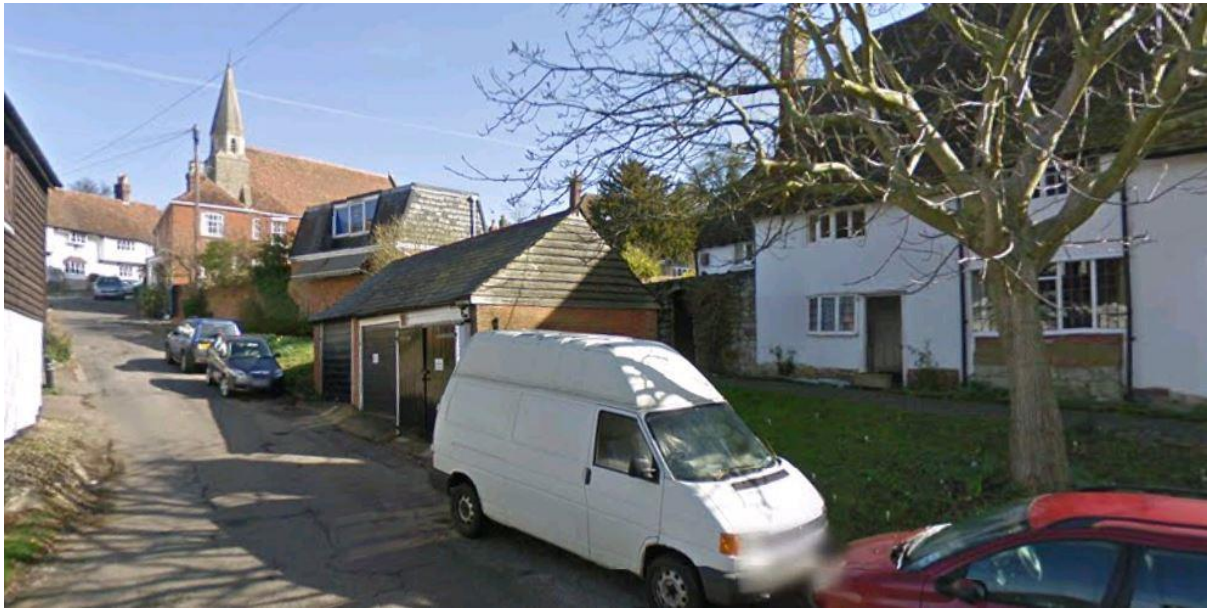
Chapel Road Sutton Valence looking north

5.8.1 This road connects Rectory Lane with Broad Street and rises steeply up the escarpment over its short length. It has a rather open nature due to the spaces between the buildings. The houses of interest, in terms of their contribution to the conservation area, are all referred to in the detailed audit which follows. Briefly they are Walnut Tree Cottages possibly from the early seventeenth century and rendered white, and Jasmine and Laurel Cottages largely weather boarded and both good examples of nineteenth century cottage design. Cross House has some interest for the cross indented in the brick gable which tends to mark it out as the home of the minister prior to the erection of the manse on the far side of the chapel.