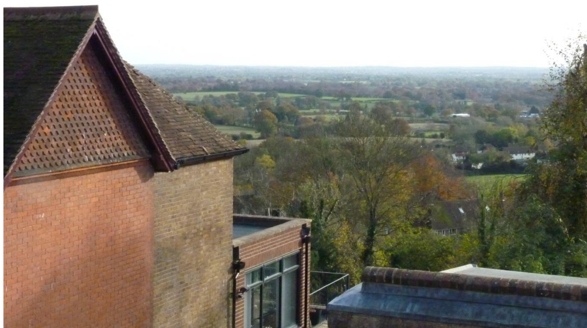
View from School Lane – looking south

3.3 Geologically Sutton Valence is located on a band of cretaceous Greensand (Lower Greensand) which forms a ridge so that the highest parts of the village, to the north and east, are approximately 70m higher than the lowest parts to the south. This allows for panoramic views from the castle ruins and other elevated parts of the village over the Weald and the land to the south.