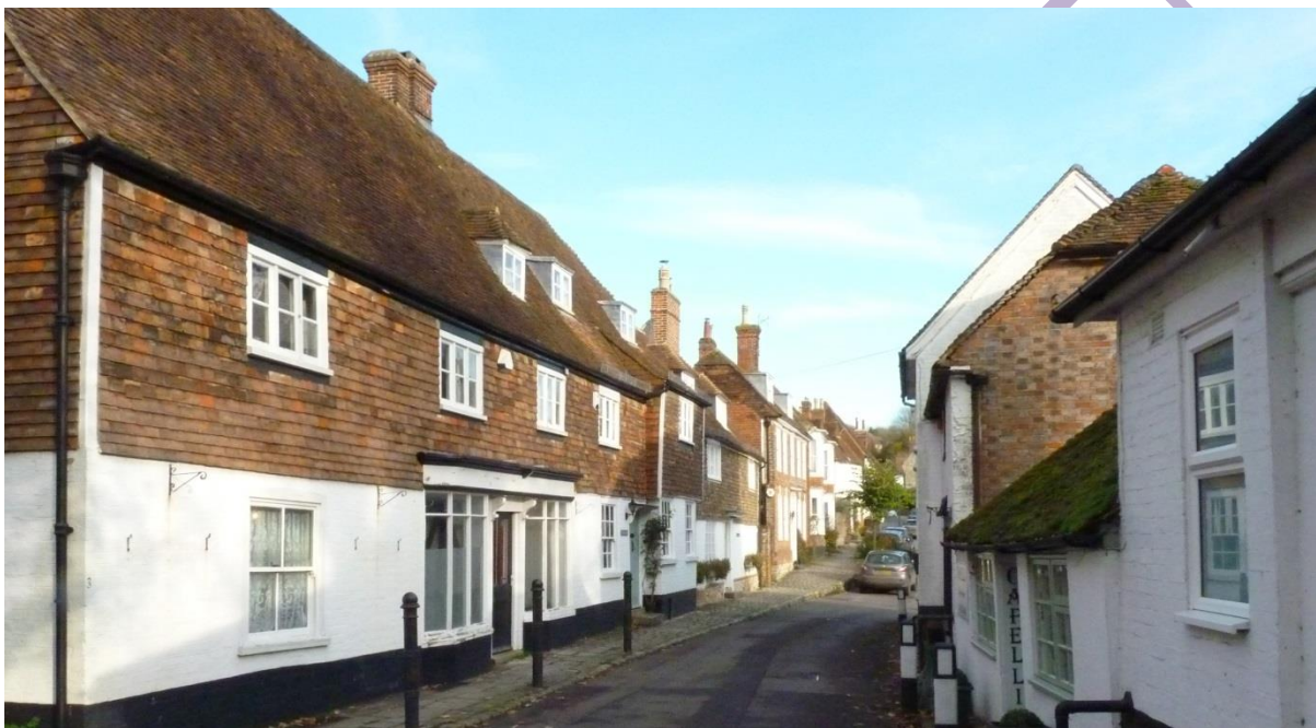
View of the High Street looking east

2.2 Open spaces are small and limited within the conservation area and tend to be effectively widening of the roads as in Broad Street or The Green but the overall feeling is not one of enclosure (except fleetingly in the High Street) because there are frequent gaps between buildings. There are also a significant number of opportunities for long range views over open countryside to the south.