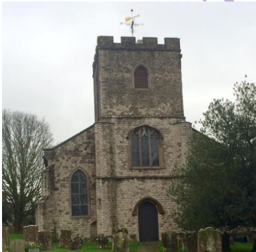
View of St Mary's Church Sutton Valence

4.2.1 There is mention in the Domesday Book of a church on the present site but no information survives to identify its form. The earliest element of a church building in Sutton Valence which survives is a 14C alter piece carved from Caen stone. For many years this was in private hands and adorned a local garden but now it is on display at the Victoria and Albert museum.