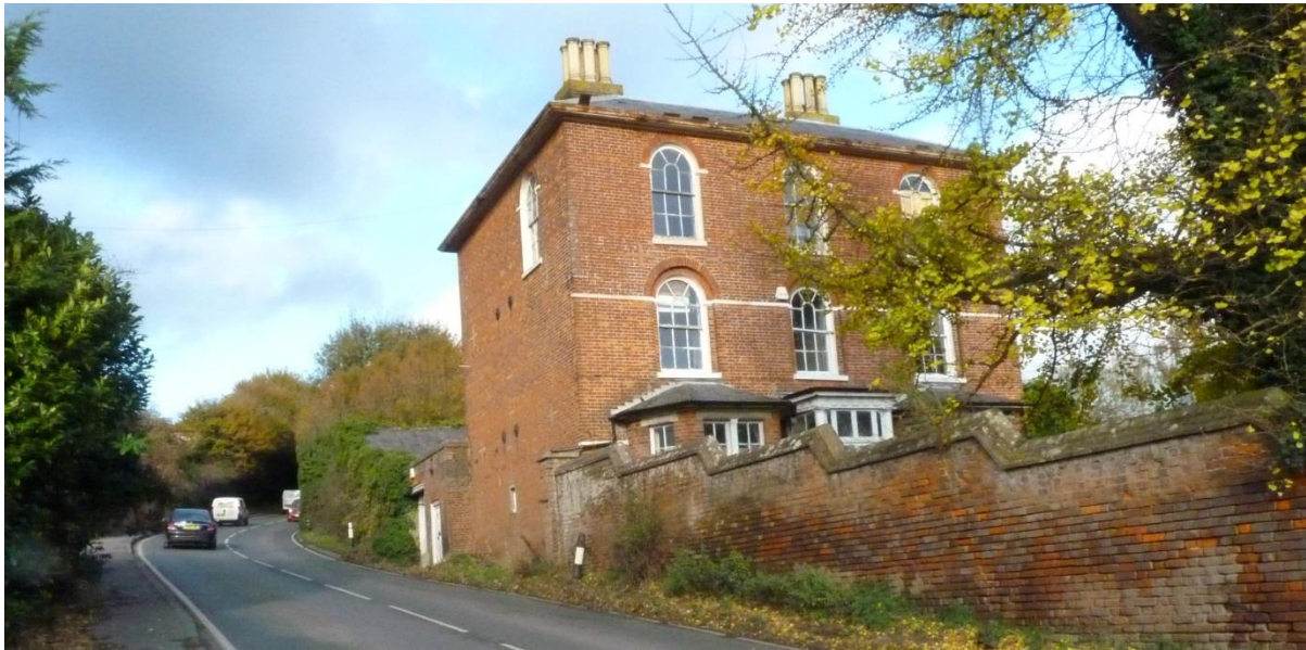
Headcorn Road looking north

5.10.1 Belringham has a strong presence as one approaches the village and presages the urban nature of the village ahead. It is a three storey brick built house originally with symmetrical north and south elevations and extensive landscaped gardens, outbuildings and an imposing brick boundary wall. Beyond the house travelling northwards nature takes over and trees crowd over the road until suddenly one reaches the centre of the village at the junction with the High Street and with Hillside House on the right. There is no doubt that this is a main road as the traffic is very heavy but turning left or right there is a much more peaceful scene almost immediately.