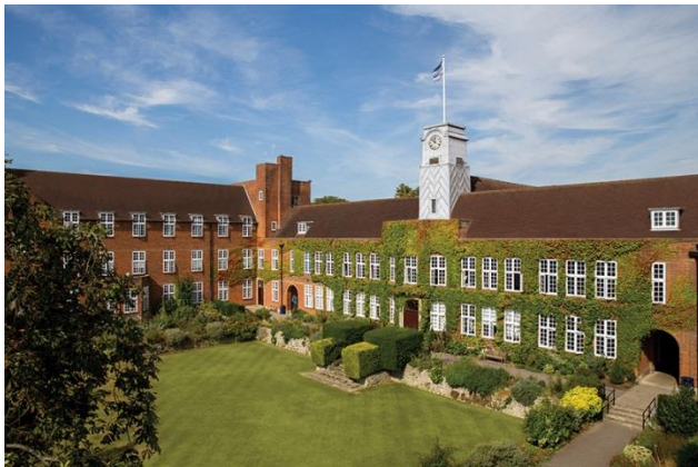
Sutton Valence School