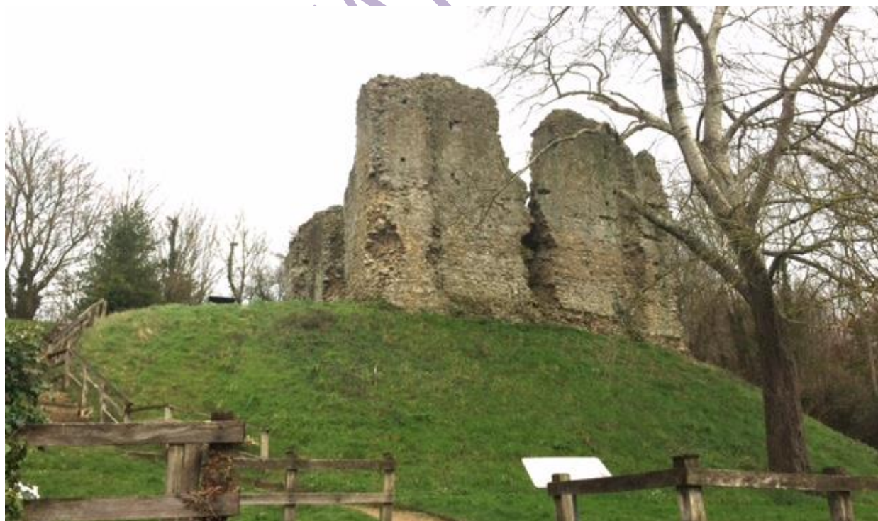
Sutton Valence Castle