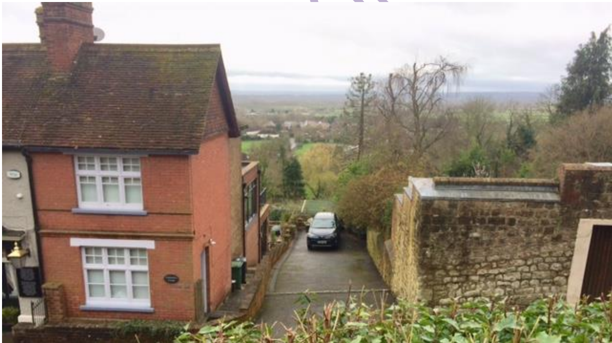
View from Lower Road

8.3 There are no Article 4 Directions currently in force in the Sutton Valence conservation area.