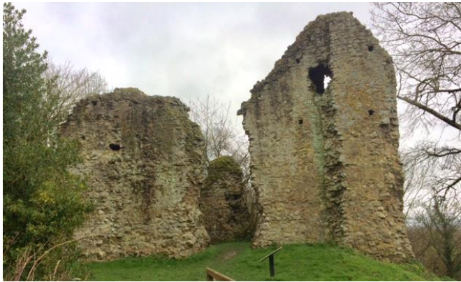
Sutton Valence Castle

4.4.1 The stone keep is all that remains of a strongly defended castle, which most probably, occupied the entire spur of the hillside in medieval times.