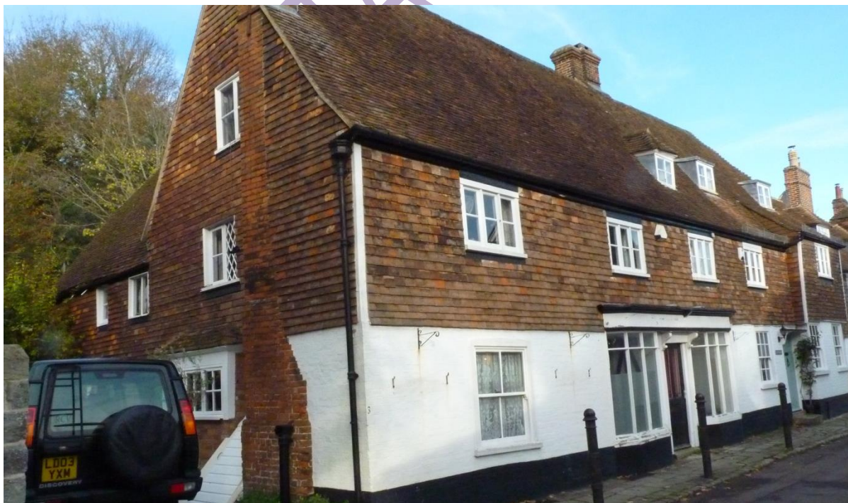
Central Stores & Sutton Dene High street

1.3 It is important to note that a conservation area management plan cannot introduce entirely new planning objectives. Instead it will need to refer to the original legislation; to government guidance (mainly National Planning Policy Framework for listed buildings); to the adopted local plan policies; and to the emerging Local Development Framework. It can interpret established legislative provisions and planning policies and explain how they will be applied within the conservation area to ensure its preservation and/or enhancement. If any particular issues are identified which do require new policies to be drawn up, the management plan can indicate these and set a programme for their development as part of the Local Development Framework process