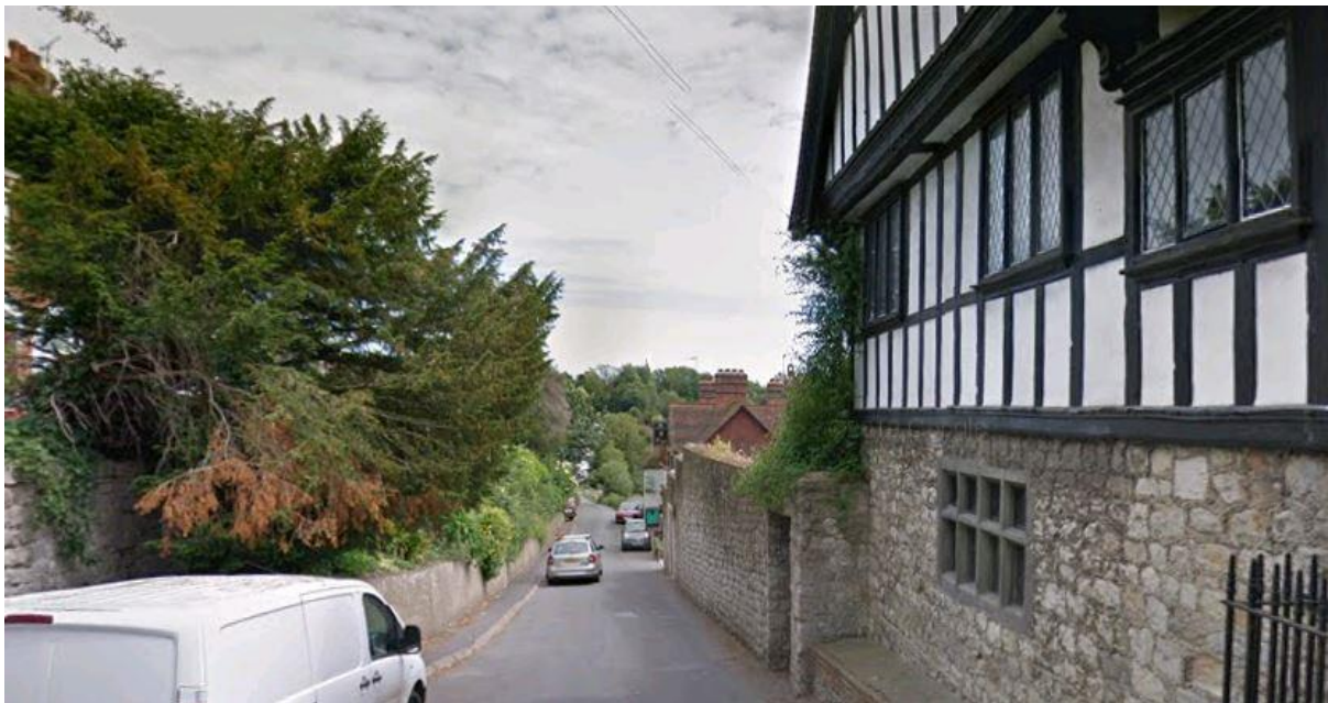
Lower Road Sutton Valence looking east

5.4.1 Lower Road joins with the High Street at the junction with North Street. It dips down steeply following a lower contour than the High Street. At its western end is Hillside House which is a timber framed house of the seventeenth century built in red brick with tile hanging.