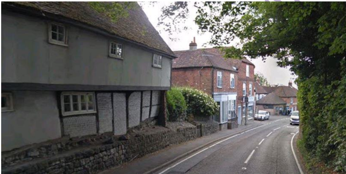
North Street looking south

6.1 Conveniently Sutton Valence can be approached from the four points of the compass with the major routes from the north or south along the A274. From the north this is named as North Street which winds its way from Maidstone and Langley and is generally reasonably flat and continuously developed until it reaches Sutton Valence where it begins to bend more sharply as it descends the Greensand ridge. The road narrows and the pavements either narrow or disappear altogether and the view is contained by the rather haphazard arrangement of mainly Victorian buildings as North Street comes to its end. There is little sense of and no visual link to the picturesque nature of the village just around the corner but there is a strong sense of this being a highly urbanised settlement.