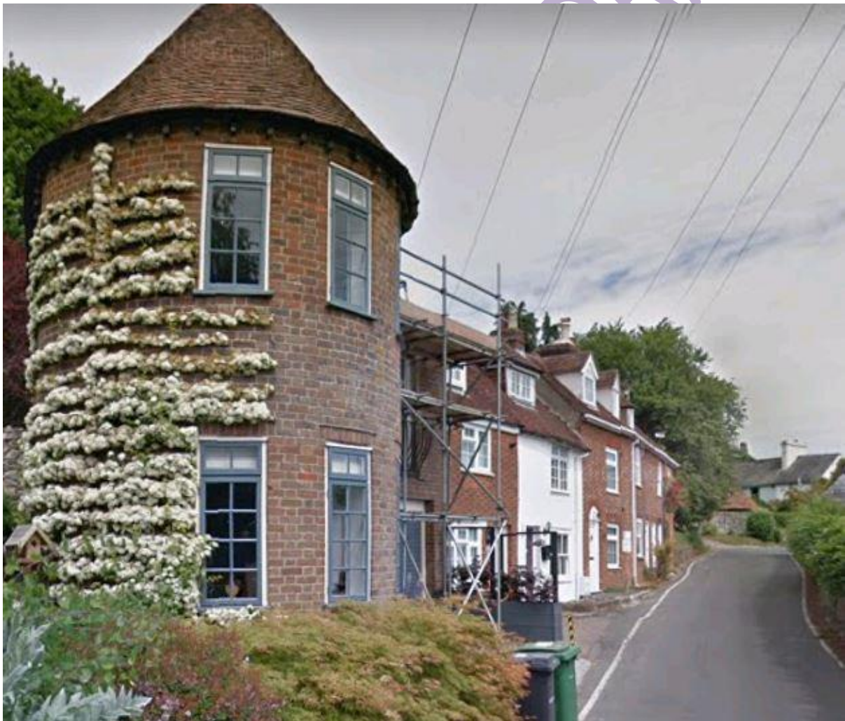
Chart Road – view from the west

5.9.5 For the pedestrian there is no pavement and a walk along Chart Road is marked by the Rag stone wall – boundary to the church - and the well landscaped grounds in front of the church. There is no street furniture to speak of and the road soon takes on the character of a country lane as it ranges westwards. Although the village continues well beyond the boundary of the conservation area the houses which line the road although varied in style are all relatively modern and have a character which sets this section of the built up area apart from the more urban feel of the village to the east.