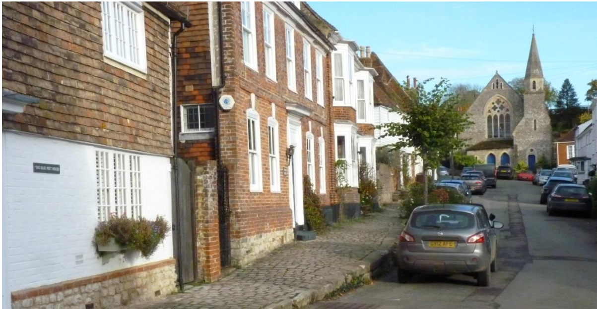
Broad Street Sutton Valence looking east

5.2.1 As one enters Broad Street the sense of enclosure lessens. This is partly due to the width of the road but also, while the buildings on the north side jostle against the back edge of the pavement those on the south side are spaced apart with areas of green planting filling the gaps.