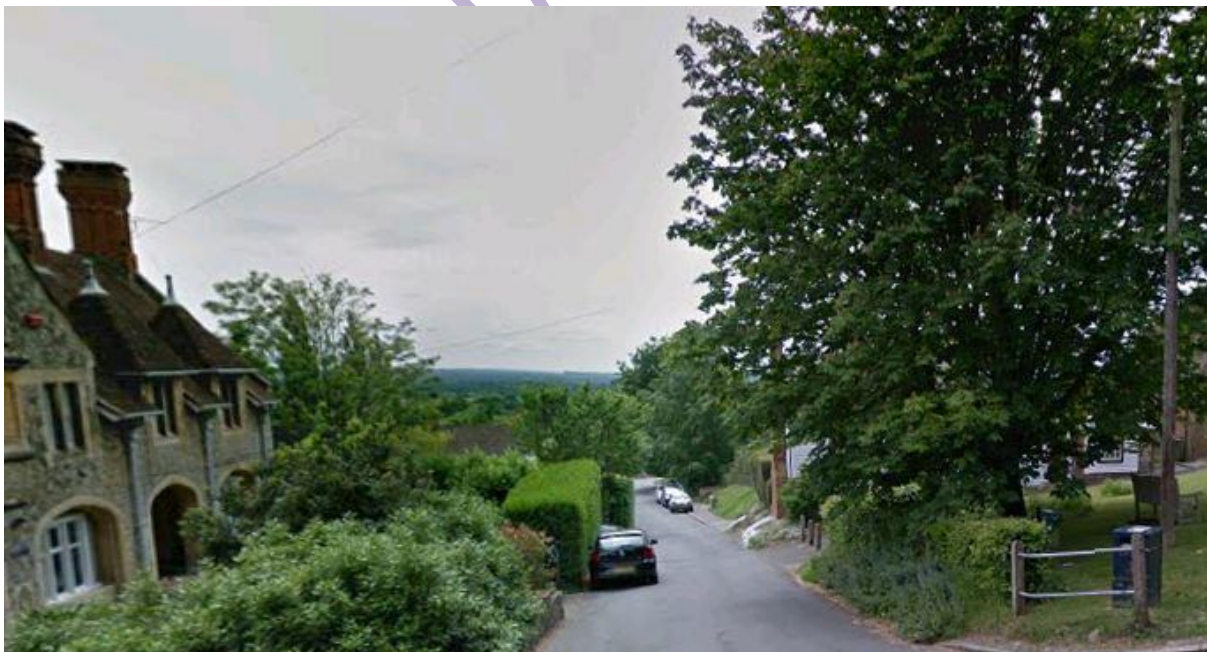
South Lane looking south – Holdgate House on the left

5.6.1 Only a small part of South Lane and one of its buildings is within the conservation area. The building is Holdgate House. This impressive building with its Rag stone walling with limestone