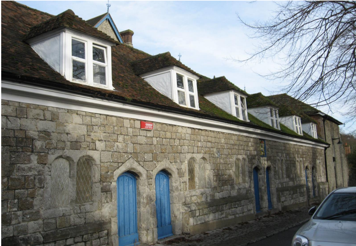
Former Alms Houses High Street