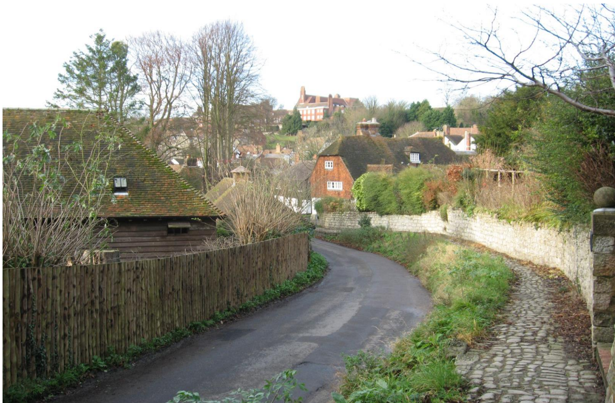
View of Sutton Valence from Rectory Lane