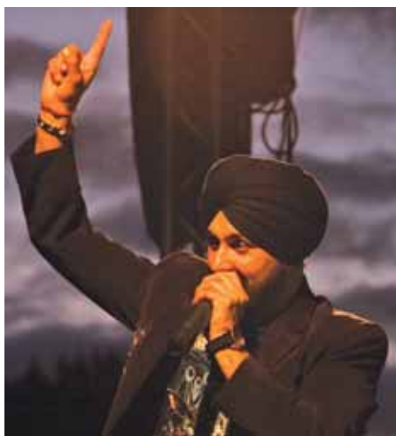
Thousands came out during September to celebrate all things cultural at this year's Maidstone Mela.