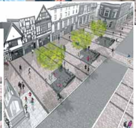
Artist impressions of what the work will look like. The work is due to be complete by May 2012.

which will stop for two weeks over Christmas.