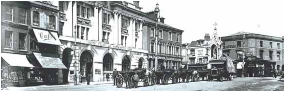
Right - The Top end of the High Street with the carriages gone all to be replaced by motorcars. C.1920's