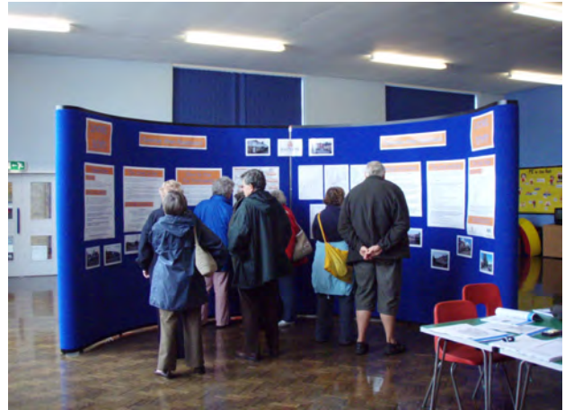
Loose Road exhibition

The Council has produced two character area assessment Supplementary Planning Documents (SPDs) for the Loose Road and London Road areas. These documents identify locally distinctive features that define the character of these areas. They provide design guidance for types of development within a number of sub-areas. The SPDs supplement adopted design policies for use when assessing development proposals, through planning applications, or land allocations in the Loose Road and London Road Character Areas.