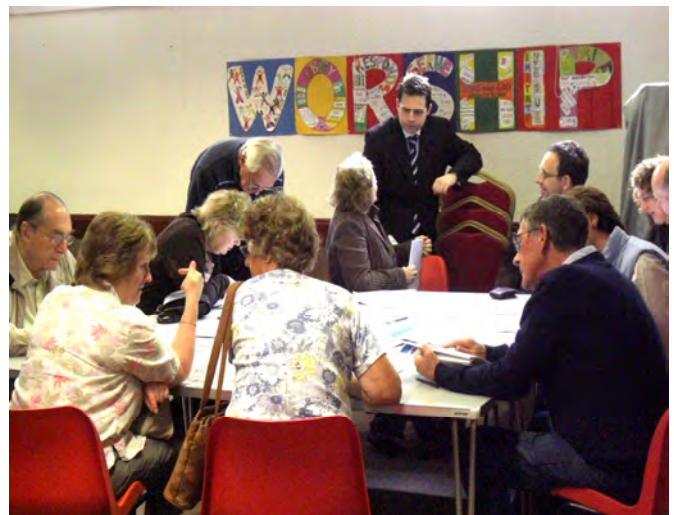
London Road exhibition

We received 74 comments for the London Road document and 63 comments for the Loose Road document. The public response at the exhibitions and to the consultation has, on the whole been supportive. Representations made by the public are being used where relevant, to guide amendments to the Character Area Assessment Supplementary Planning Documents. The wide input of knowledge and expertise received from local people throughout the process of drafting the documents and during the public consultation has been invaluable. The SPDs are expected to be adopted in December 2008.